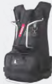
Nylon Backpack (for portable repeater only)(black) NCN010