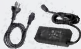
Power Adapter for Portable Repeater PS7502