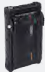
Power Management System PV3001