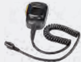
Waterproof Remote Speaker Microphone ( IP67 ) SM18A1

Optional antenna designed by Hytera is highly recommended. *Outdoor use of RD96X with antenna should avoid thunderstorms.