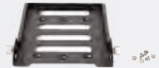
Multi-Functional Installation Bracket BRK17

Optional antenna designed by Hytera is highly recommended. *Outdoor use of RD96X with antenna should avoid thunderstorms.